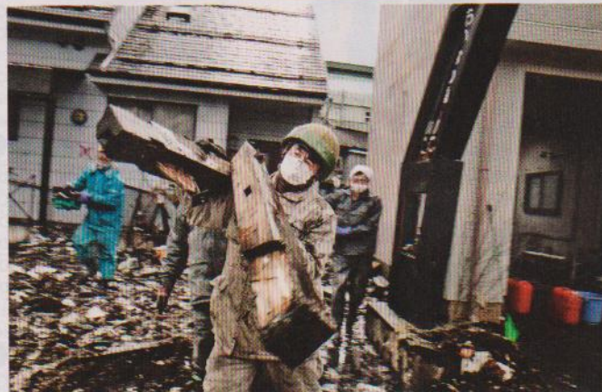
Rebuilding Volunteers help clean up Kamaishi

Ways to thwart piracy, from razor wire to sonic cannons p54 Catastrophe bonds don't always give insurers a hedge. Just look at the payout in Japan p55 Speed Dial: Representative Jim Langevin on threats to U.S. cybersecurity p56